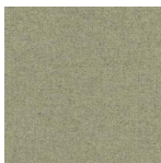
Divina MD 0913