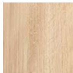
Oak Whitenened Oil